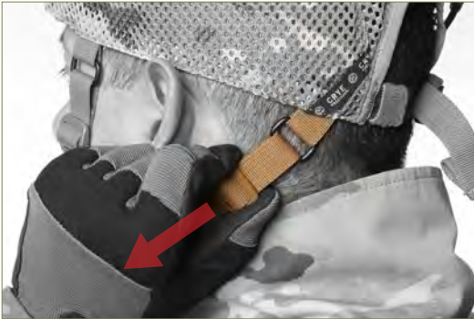
5. Pull rear adjustment strap hardware down until snug.