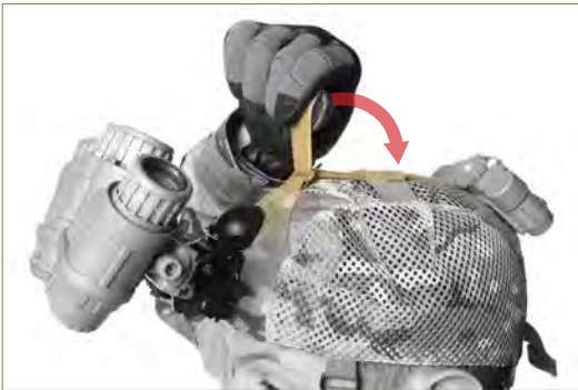
7. Front-to-back adjustment strap can be tensioned to balance the night vision device.