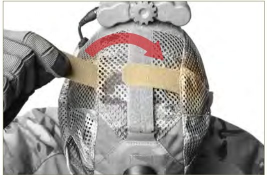
6. If bottom edge of NightCap™ headband is touching your ears, adjust side-to-side top adjustment tabs.