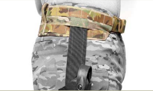
4. Configure any height adjustments for drop holster and reattach drop holster webbing. Close drop holster slot to complete installation.