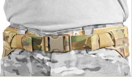
4. Fasten outer belt buckle. Outer belt adjustments may be made by tightening or loosening the outer belt webbing.