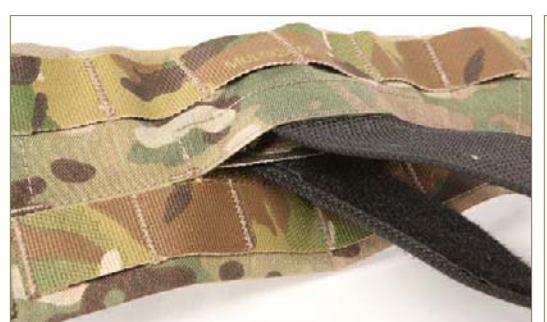
3. Continue to route drop holster webbing through the slot around the belt and return as shown. Tuck belt back into slot.