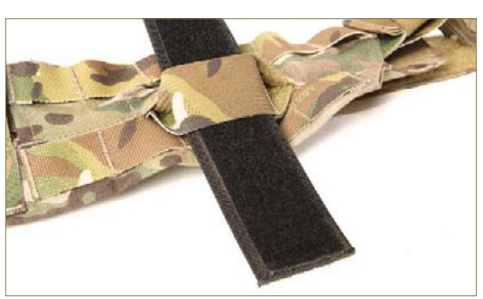
2. Insert drop holster webbing into slot and route over belt as shown.