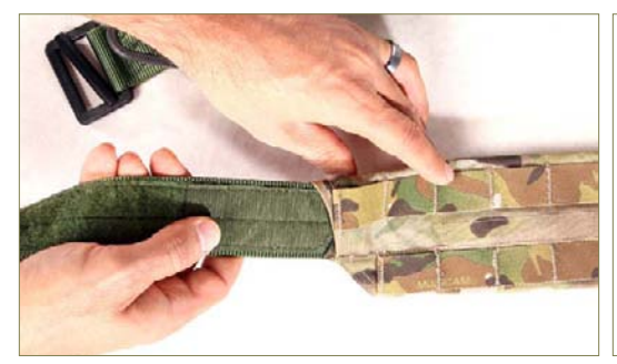
1. Remove MRB™ outer belt by removing buckle(s) from either side and pulling out the belt completely to separate it from the assembly. Insert rigger belt into belt slot as shown.