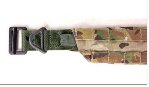
2. Continue to slide the rigger's belt through the sleeve in the outer cover until it is completely routed through. MRB™ can now be donned using the alternative belt.