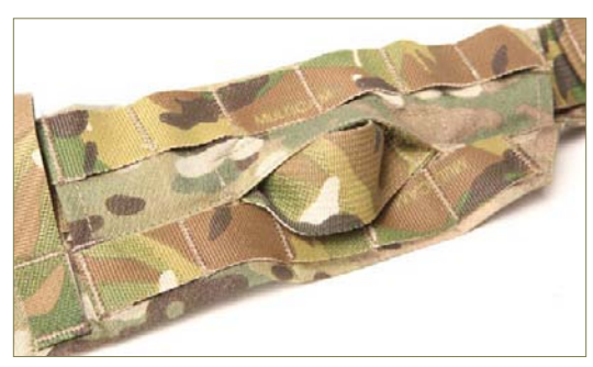
There are two slots for installing drop holsters; one on each side (left and right) of the outer cover. Locate the drop holster pocket on the exterior side of the outer cover. Open slot to reveal MRB™ outer belt or alternative rigger's belt (see page 5).