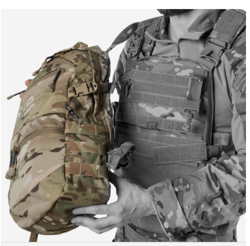
SELF ACCESS CONFIGURATION