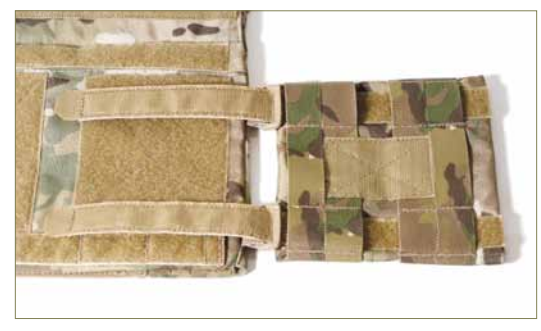
1. Lay front carrier flat as shown. Open front flap of carrier. Locate two buckles on side edge of carrier. Position side pouch so that straps face upward. Open straps of side pouch and insert into buckles as shown.