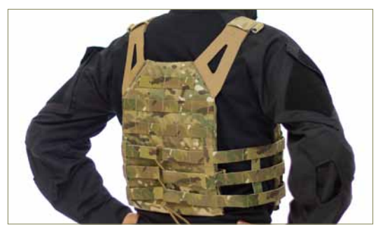
4. If using Skeletal<sup>™</sup> cummerbund, the elastic cord(s) should stretch under some tension to ensure that the cummerbund will not shift during movement.

Doffing: Reverse order of steps listed above.