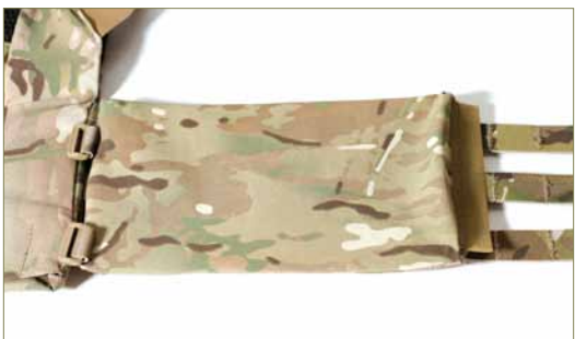
4. This flank pouch supports low-vis ballistic protection up to Level IV standalone plates. Up to two 6x6" plates can fit side-by-side in pouch. To install ballistic protection, flip pouch and cummerbund over and open pouch as shown. Insert ballistic protection as desired and close pouch.