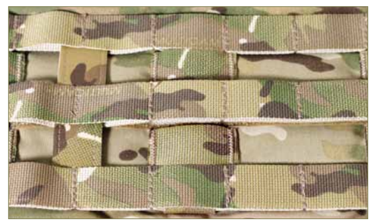
3. Snap pouch straps back together once they are successfully woven through both the cummerbund and pouch webbing as instructed. The snaps should be underneath the middle row of Skeletal™ cummerbund webbing when complete.