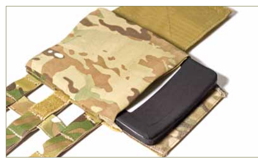
To install ballistic protection, turn over cummerbund with pouch installed and open plate pocket. Insert ballistic protection and close pocket.

2. Weave the hook strap of the plate pouch through the webbing openings of the cummerbund and pouch. The strap should first go through the opening in between the two layers of cummerbund webbing (red), then through the webbing of the pouch (blue). Secure the remainder of the strap onto the plate pouch as shown. Weaving through the two layers of the Skeletal<sup>™</sup> cummerbund allows other items to still attach to the outer side of the cummerbund.