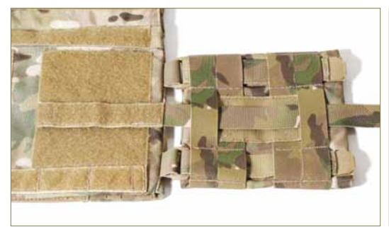
Install ballistic protection (refer to Step 3 on previous page). When donning JPC with single straps, the wearer may weave the single strap through the middle rows of webbing on the pouch as shown for added stability.

2. Secure pouch to buckles by weaving straps back through webbing on pouch and securing hook and loop panels together as shown. Tip: It may be helpful to twist the straps over while weaving through the webbing so as to not catch the hook and loop panels until the strap is twisted back over.