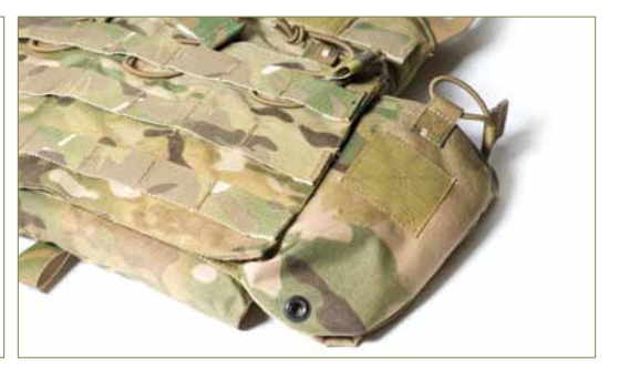
2. Close front flap to ensure proper placement. This pouch accessory is compatible with both Skeletal<sup>™</sup> cummerbund and single straps and should be worn underneath either option. Supports MBITR or two mags.