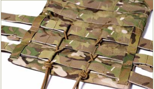
3B. If additional cummerbund size accommodation is required, the cummerbund ends can be tied to the MOLLE panel as pictured in a similar zigzag weaving pattern. A second elastic cord is included for this configuration.