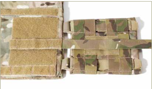
Alternatively, the single strap may simply be worn directly over the pouch without weaving the single strap through the middle rows of webbing to allow easier doffing.