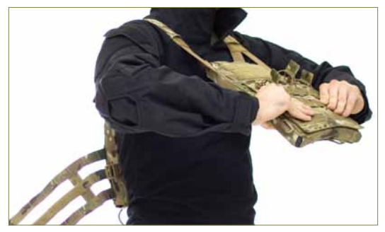
1. Remove any headgear. Place vest over head as shown, centering both front and back panels on the body.