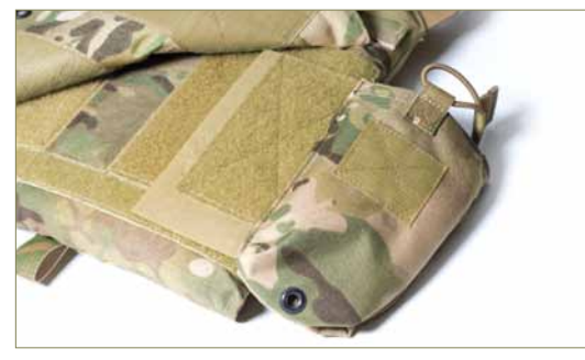
1. The MBITR/mag pouch comes in both left and right side versions for both sides of the front carrier. To install pouch, lay front carrier flat as shown. Open front flap of carrier and attach hook panel of pouch to loop panel of carrier. Repeat for other side if desired.