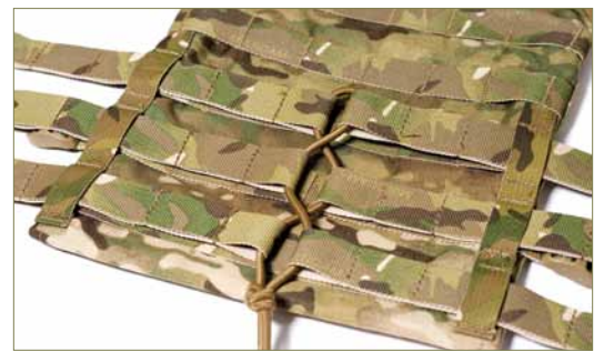
3A. Tie a knot in the elastic cord to secure the weave. The extra slack of the elastic cord can be tightened or loosened to accommodate personal preference. Pull cummerbunds apart to ensure the weave and knot are secure.