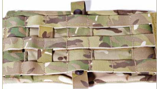
2. Weave the pouch straps through the webbing openings of the cummerbund and pouch. The strap should first go through the opening in between the two layers of cummerbund webbing, then through the webbing of the pouch. This option allows other items to attach to the outer side of the cummerbund.

Lay front carrier flat as shown. Unsnap all three pouch straps as shown and lay underneath Skeleta<sup>TM</sup> cummerbund as shown. Position flank pouch so that the straps face upward and opening of pouch opens towards the rear of the carrier. Pouch can be installed anywhere along Skeleta<sup>TM</sup> cummerbund.