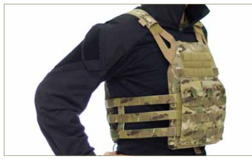
3. Close front panel flap to secure cummerbund (or single straps) into place and ensure that vest feels secure and fits comfortably. If adjustments are required, see next page.