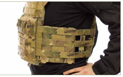
4. Don vest to check that the side pouch is securely fastened to the cummerbund. Ensure that placement of pouch is correct and make any adjustments as necessary. Repeat for other side of vest if desired.