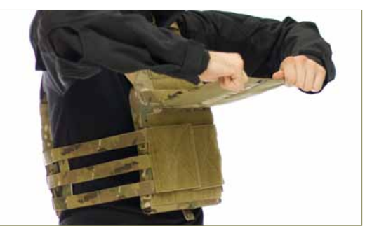
2. Open front panel flap of carrier and attach hook panels of cummerbund (or single straps) to loop panels of front carrier.