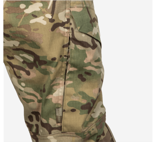
LOW PROFILE CARGO POCKET