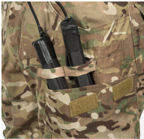
CARGO POCKET PASS-THROUGHS FOR DOOR CHARGES