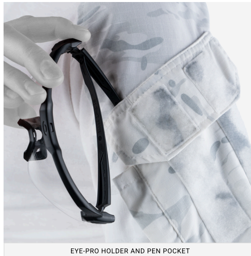
EYE-PRO HOLDER AND PEN POCKET