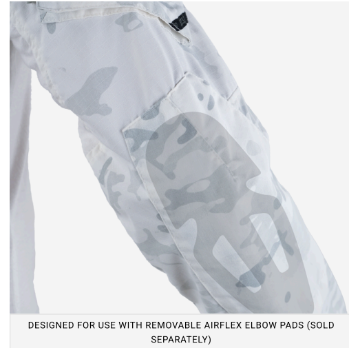
DESIGNED FOR USE WITH REMOVABLE AIRFLEX ELBOW PADS (SOLD SEPARATELY)