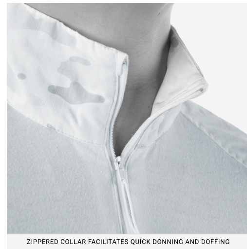
ZIPPERED COLLAR FACILITATES QUICK DONNING AND DOFFING