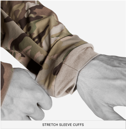
STRETCH SLEEVE CUFFS