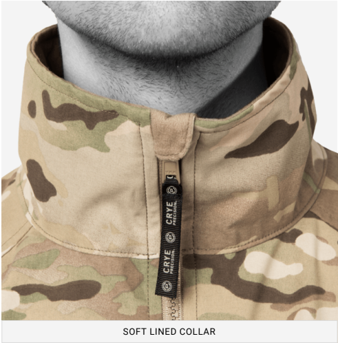
SOFT LINED COLLAR