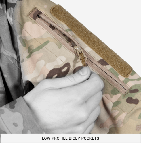
LOW PROFILE BICEP POCKETS