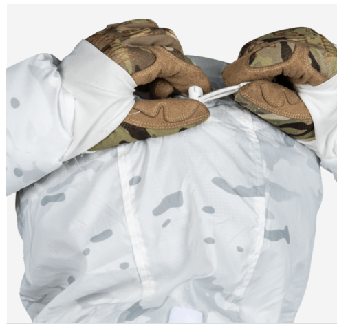
ADJUSTABLE HOOD FIT FOR HELMETS