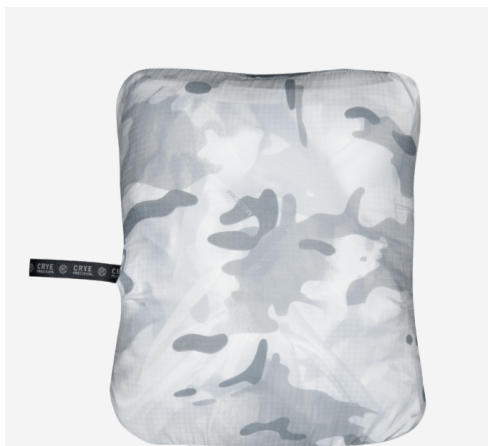
PACKS INTO ITSELF FOR USE AS PILLOW