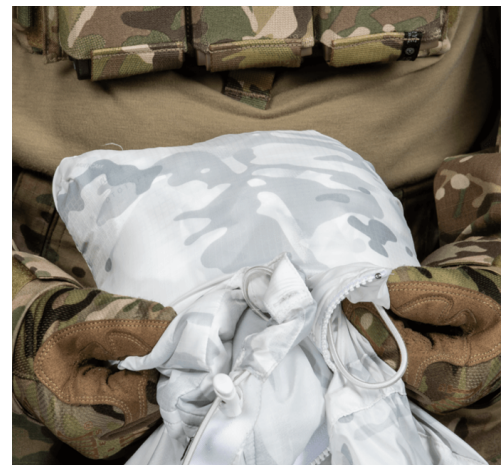
CAN STUFF INTO INTERNAL POCKET