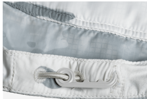
J-HOOK STOWS WHEN NOT IN USE