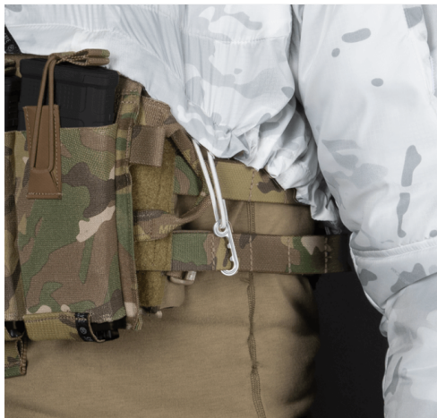
J-HOOK ATTACHES JACKET TO VEST