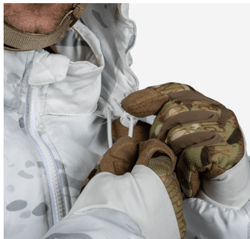
ADJUSTABLE HOOD OPENING