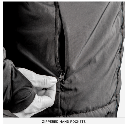
ZIPPERED HAND POCKETS