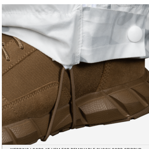
WEBBING LOOPS AT HEM FOR REMOVABLE SHOCK CORD STIRRUP