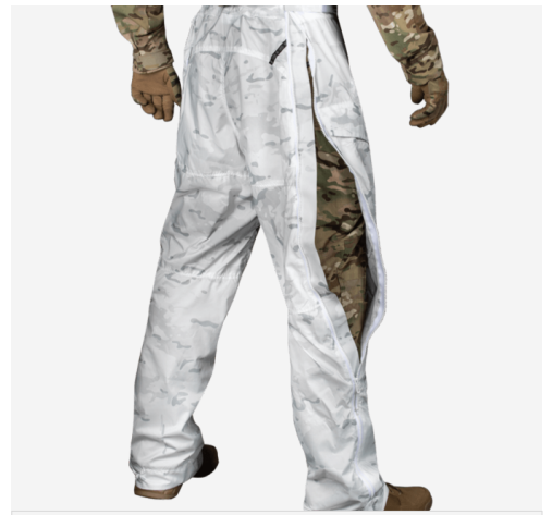
FULL LENGTH LEG OPENING FOR EASY DONNING & DOFFING