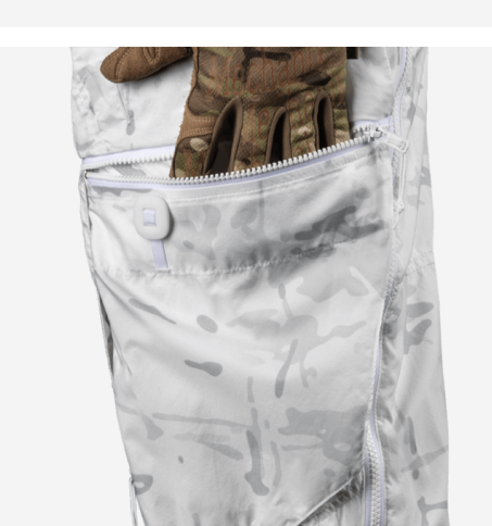
EXPANDABLE CARGO POCKET WITH ZIPPERED OPENING AND SECONDARY FIELD EXPEDIENT BUTTON CLOSURE