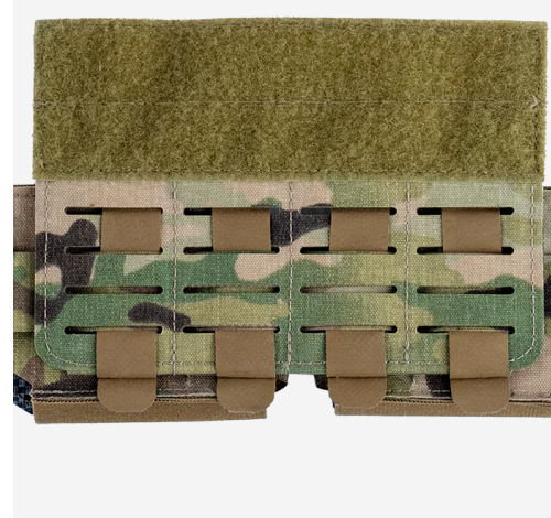
DURABLE NEOPRENE STRAPS SECURELY ATTACH TO THE MOLLE PANEL