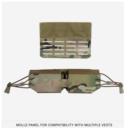
MOLLE PANEL FOR COMPATIBILITY WITH MULTIPLE VESTS