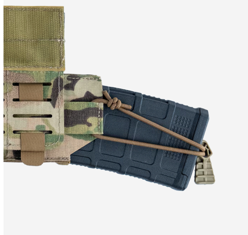
ELASTIC BODY AND SHOCK CORD ENSURE SECURE RETENTION