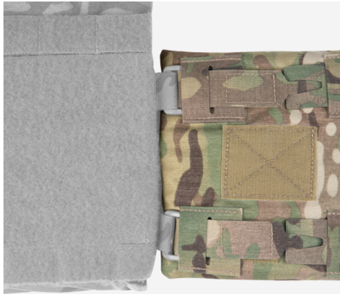
COMPATIBLE WITH JPC™ / SPC™ PLATE CARRIERS