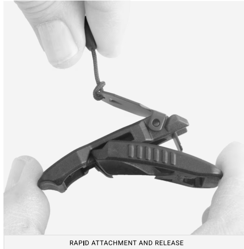
RAPID ATTACHMENT AND RELEASE