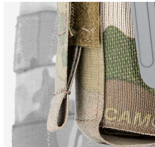
DUAL SECURITY FLAP CLOSURE