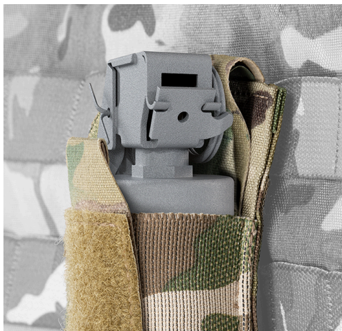
STOWABLE TOP FLAP FOR RAPID ACCESS