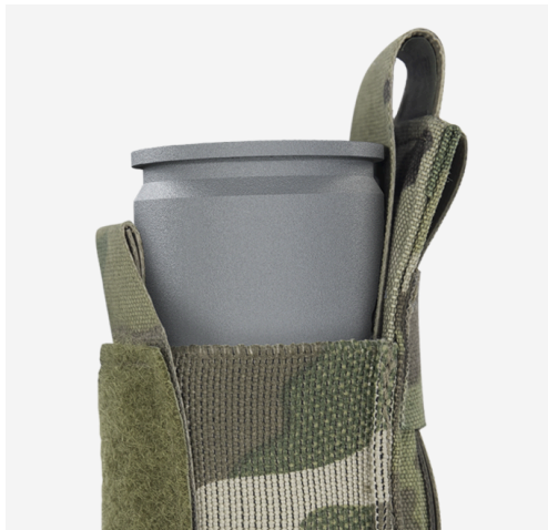
ACCOMMODATES FLASHBANG & 40MM GRENADES