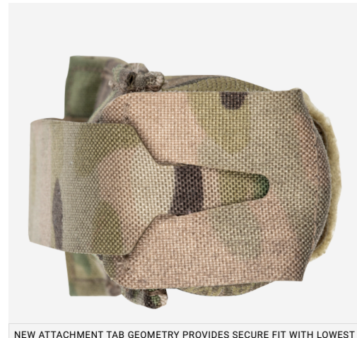
NEW ATTACHMENT TAB GEOMETRY PROVIDES SECURE FIT WITH LOWEST PROFILE