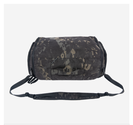
DURABLE ABRASION RESISTANT 1000D CORDURA® EXTERIOR FABRIC