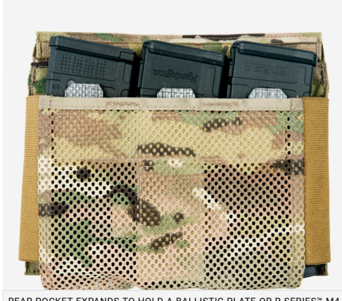
REAR POCKET EXPANDS TO HOLD A BALLISTIC PLATE OR R-SERIES™ M4 MAG RETAINER