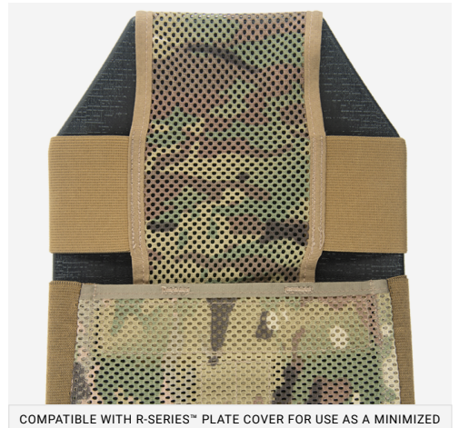
COMPATIBLE WITH R-SERIES™ PLATE COVER FOR USE AS A MINIMIZED PLATE CARRIER