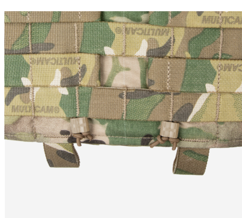
LOW PROFILE SHOCK CORD RETAINERS MANAGE CONNECTION IN THE $\operatorname{\textbf{REAR}}$