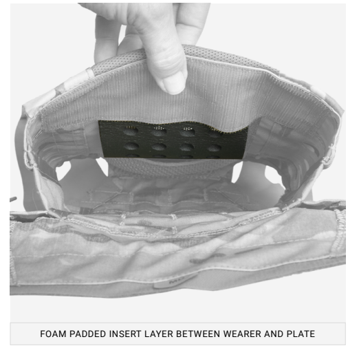
FOAM PADDED INSERT LAYER BETWEEN WEARER AND PLATE