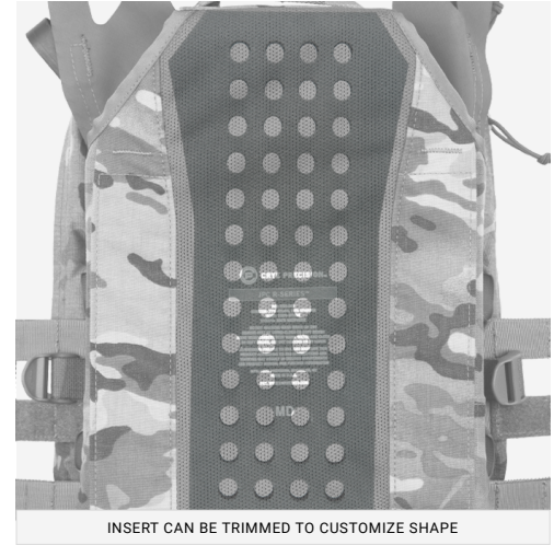
INSERT CAN BE TRIMMED TO CUSTOMIZE SHAPE