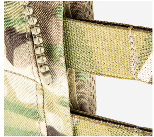
SIDE VELCRO® ATTACHMENT POINTS FOR CONNECTING R-SERIES™ SIDE POUCHES