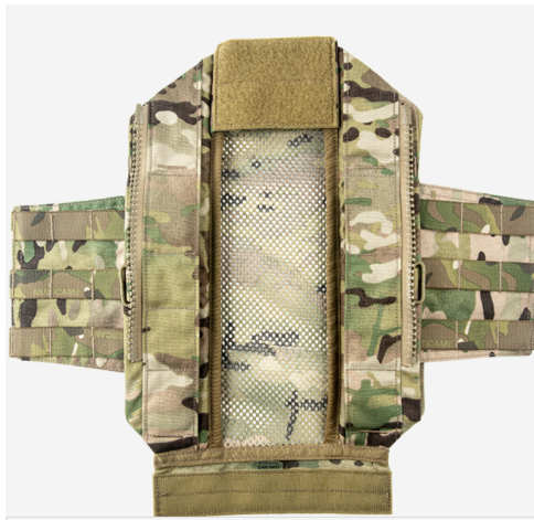
CENTER MESH DESIGN ALLOWS FOR AIRFLOW.