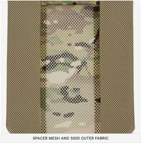
SPACER MESH AND 500D OUTER FABRIC