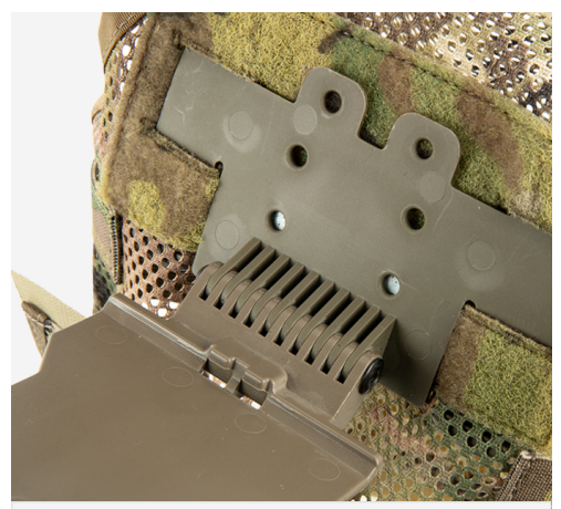
TOP INTERIOR SLOTS ALLOW FOR ATAK FLIP DOWN ADAPTOR ATTACHMENT